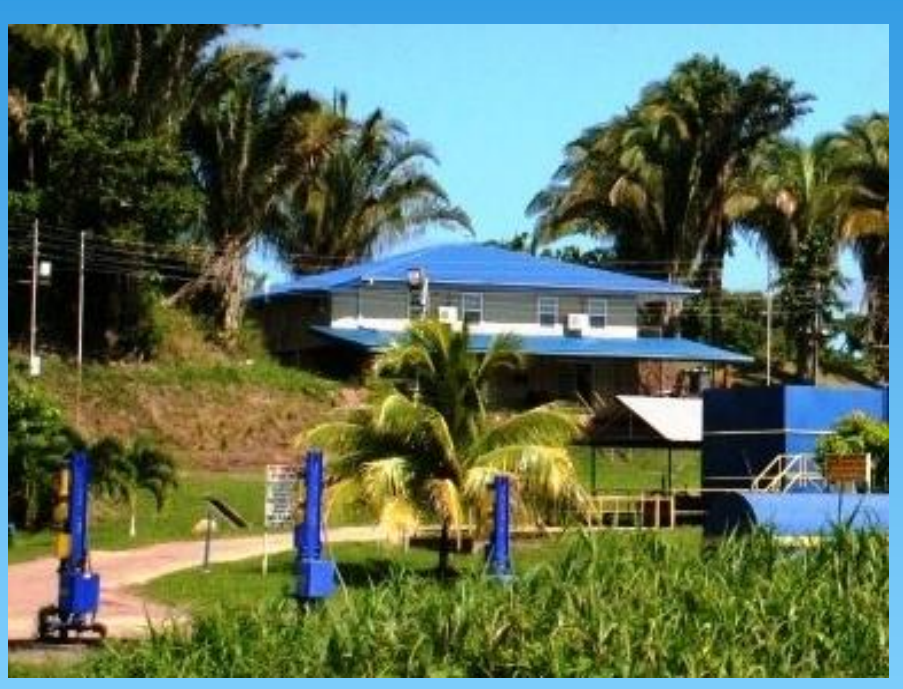
First Digital Oil Field in Trinidad New Horizon's Parrylands